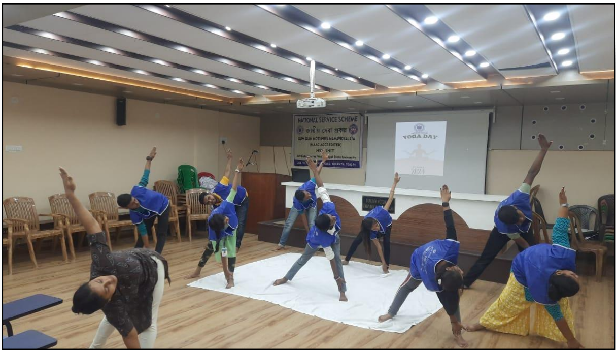
Students Performing Yoga